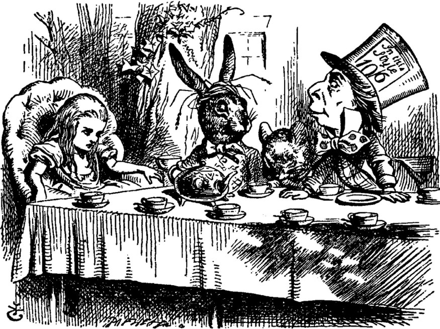
This illustration is from Alice's Adventures in Wonderland by Lewis Carroll, illustrated by John Tenniel (1865).

The illustration above represents the scene at the start of the crazy, zany music, Mad Tea Party . Listen carefully to the music. Based on the sounds you hear, draw a picture in the box to the right to show what the scene might look like by the end of the music. Share your ideas with a partner and explain how your picture represents the sound of the music.